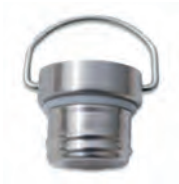
T1 PREMIUM STAINLESS STEEL TOP + 0.95p