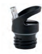
T2 SPORTS TOP + 0.30p